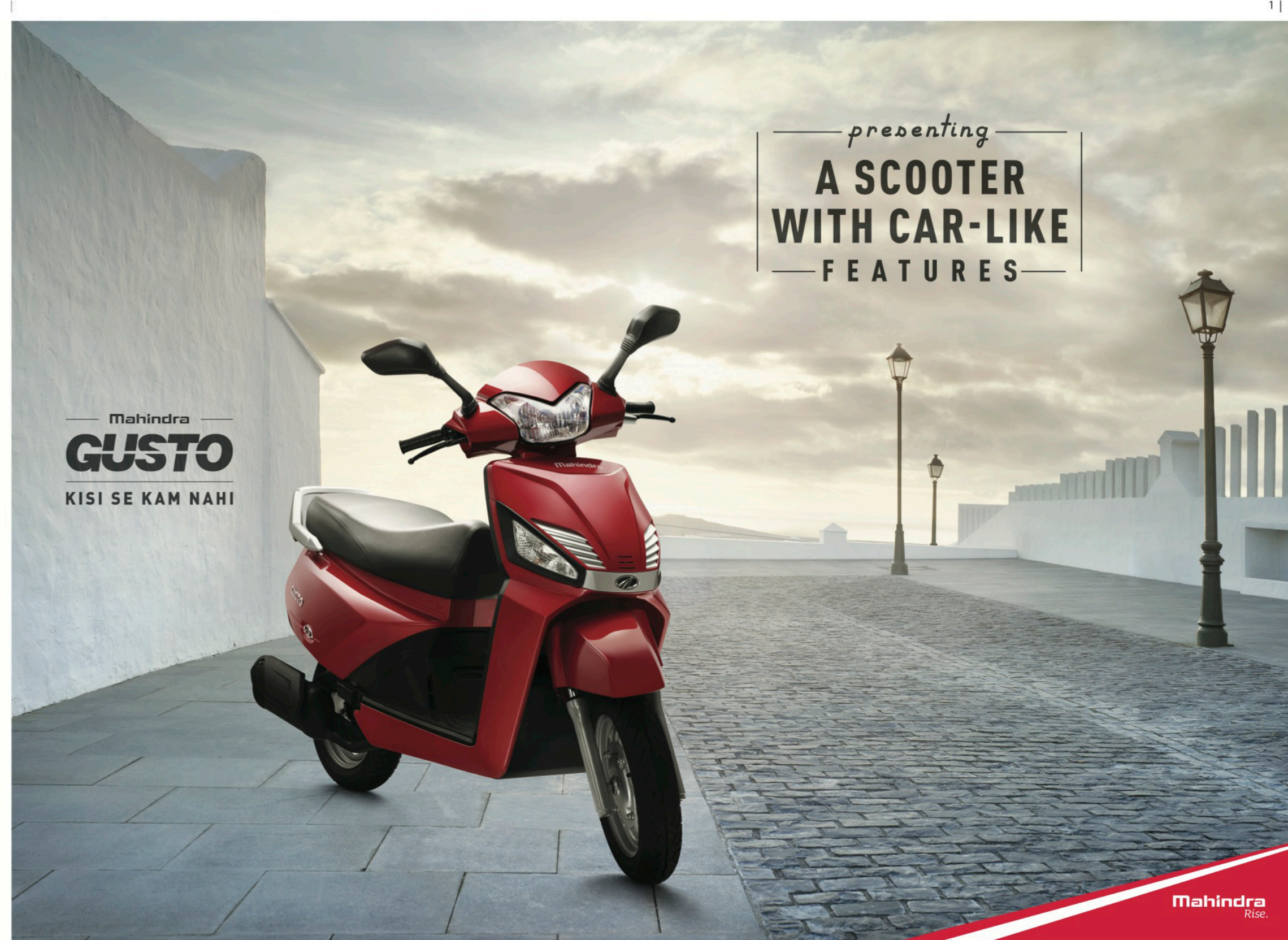
Size: A4 Close Front & Back